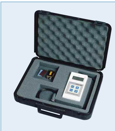
DCF/DCN 900 Complete Kit